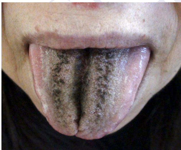
Figure 1 - Lingua villosa nigra