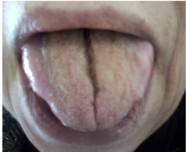
Figure 2 - Disappearance of lingua villosa nigra after electronic cigarette discontinuation

A 66-year old female patient presented to her family physician an asymptomatic black discoloration of the tongue she noted that day (Fig. 1). There was no other sign associated. The case was presented to another family physician and the diagnosis of lingua villosa nigra 1-5 was established. This patient was a hard smoker and coffee drinker, with hypertension and history of depression. She had stopped tobacco smoking and initiated electronic cigarette a few weeks before. After that, when she stopped using the electronic cigarette and started tobacco cigarette,