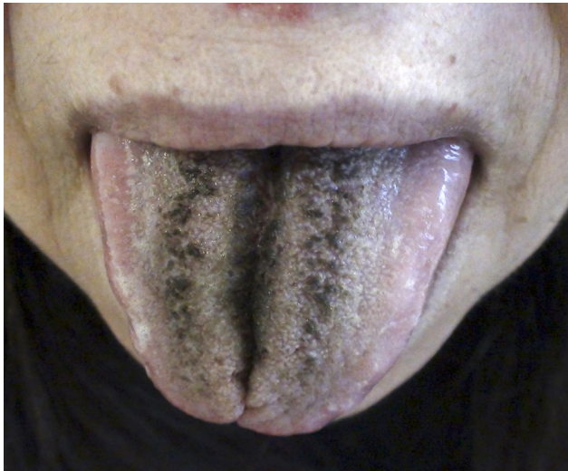
Figure 1 - Lingua villosa nigra

Palavras-chave: Hábito de Fumar; Língua Pilosa; Produtos do Tabaco.