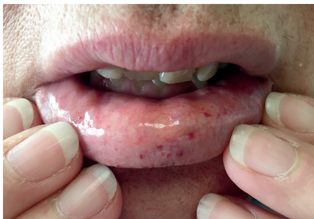
Figure 1 – Telangiectasias in periungual folds and cuticular dystrophy

Keywords: Capillaries; Nail Diseases; Scleroderma, Systemic; Telangiectasis Palavras-chave: Capilares; Doenças da Unha; Esclerodermia Sistémica; Telangiectasia