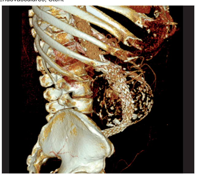
Figure 2 – Post-operative CTA reconstruction. The calcified boundaries of the aneurysmal sac are visible, but flow is seen only inside the implanted graft.

A 79-year-old male patient with multiple cardiovascular comorbidities was admitted due to abdominal pain. Computed tomography angiography (CTA) revealed an infrarenal abdominal aortic aneurysm with 83 mm of diameter (Fig. 1). Fracture of the aneurysm's parietal calcification suggesting impending rupture was noted, and surgery was planned. An endovascular aneurysm repair was performed, using a bifurcated graft with suprarenal stent fixation. On completion of angiography, the calcified boundaries of the aneurysmal sac are visible, but flow is seen only inside the implanted graft, confirming proper aneurysm exclusion.