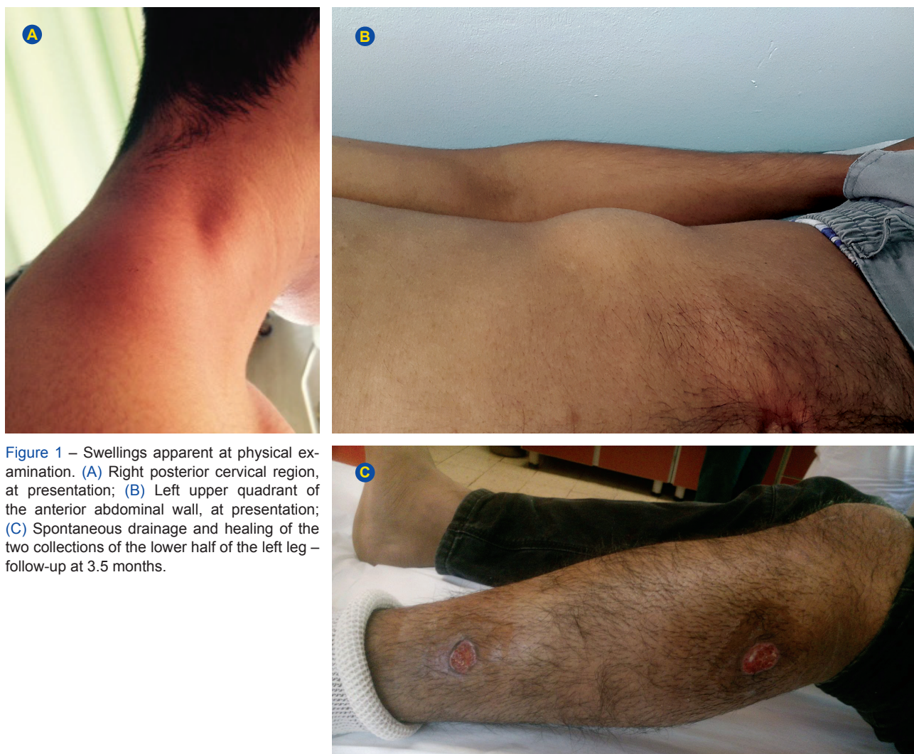
Figure 1 – Swellings apparent at physical examination. (A) Right posterior cervical region, at presentation; (B) Left upper quadrant of the anterior abdominal wall, at presentation; (C) Spontaneous drainage and healing of the two collections of the lower half of the left leg – follow-up at 3.5 months.

Blood tests upon admission to our unit showed mild microcytic hypochromic anemia (hemoglobin: 10.5 mg/L; mean corpuscular volume: 70.4 fL; mean corpuscular hemoglobin: 22.3 pg) and slightly elevated C-reactive protein (35 mg/L) and erythrocyte sedimentation rate (51 mm/h). Serum creatine phosphokinase (CPK) was not elevated. Renal function and white blood cell count were normal. Human immunodeficiency virus (HIV) screening was negative. Blood cultures (including in specialized medium for mycobacteria) yielded negative results. Human immunodeficiency virus (HIV) screening was negative. A whole body computed tomography (CT) scan showed multifocal (7) intramuscular and subcutaneous hypodense collections with a peripheral rim enhancement after contrast injection: (Figs. 2A, B e C) 1) right cervical region, in the splenius capitis muscle (54 × 34 mm); 2) lateral side of the left half of the thoracic wall, in the latissimus dorsi muscle (11 × 16 mm); 3) left flank of the anterior abdominal wall, between the external oblique and the transversus abdominis muscles (42 × 29 × 72mm); 4) left flank immediately above the iliac