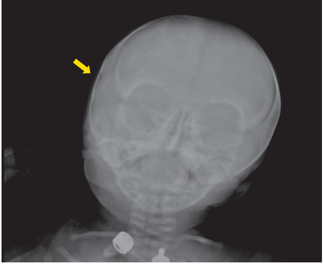
Figure 1 – Skull x-ray: right temporoparietal fracture

Serial brain CT scans (D3 and D8) were performed, with evidence of partial reabsorption of intra-axial haemorrhagic lesion and resolution of subarachnoid haemorrhage. The skeleton x-ray showed no evidence of additional fractures. The neurological examination was always normal.