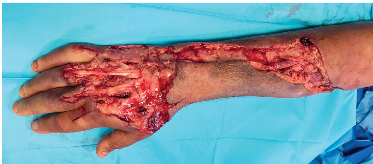
Figure 2 – Presentation after debridement

In 1981 an 'unnamed marine Vibrio ' was isolated as the