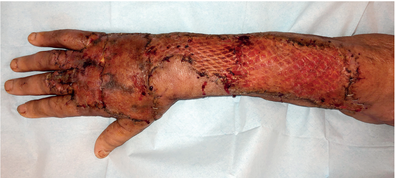
Figure 4 – Two months post-op