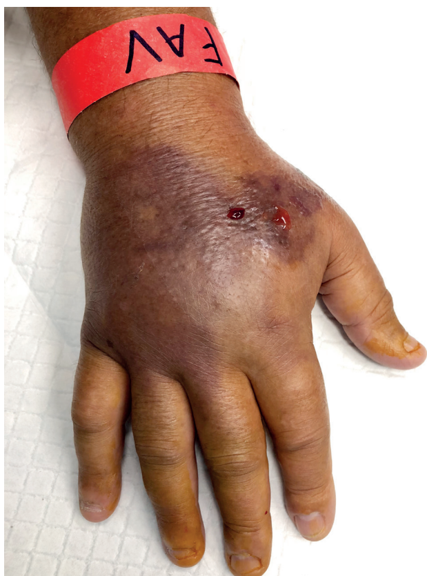
Figure 1 – Clinical presentation at admission, 12 hours after injury

the hand and forearm were skin grafted (Fig. 4). The patient was discharged from the hospital 70 days after admission after a total of six surgical interventions. A splint holding the wrist in extension was applied after ADM application until two weeks after skin graft. Daily physiotherapy was maintained for the next three months, and three times per week during the following six months. The patient was able to resume his daily life activities without restrictions. At present, he has a decreased amplitude of wrist and finger flexion (Fig. 5), but no extension restrictions.