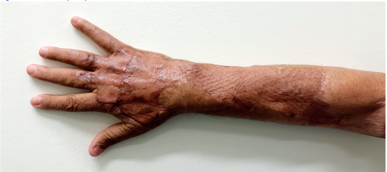
Figure 5 – Six months post-op