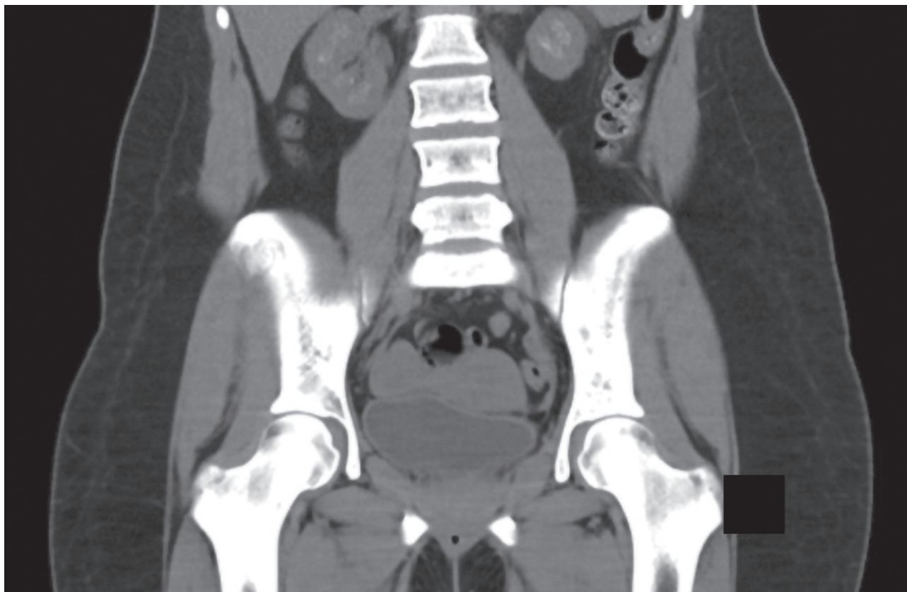
Figure 4 – Hip CT (two-month follow-up)