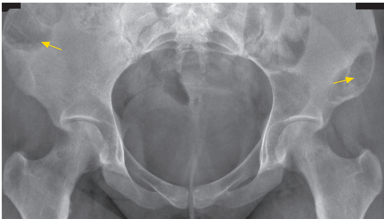
Figure 1 – Hip x-ray (yellow arrows – lytic bone lesions on iliac bone)

The hip x-ray and computer tomography (CT) presented several lytic images in the iliac bones and femurs, with cortical thinning and associated soft tissue component – which suggested the possibility of secondary lesions (Figs.1 and 2).