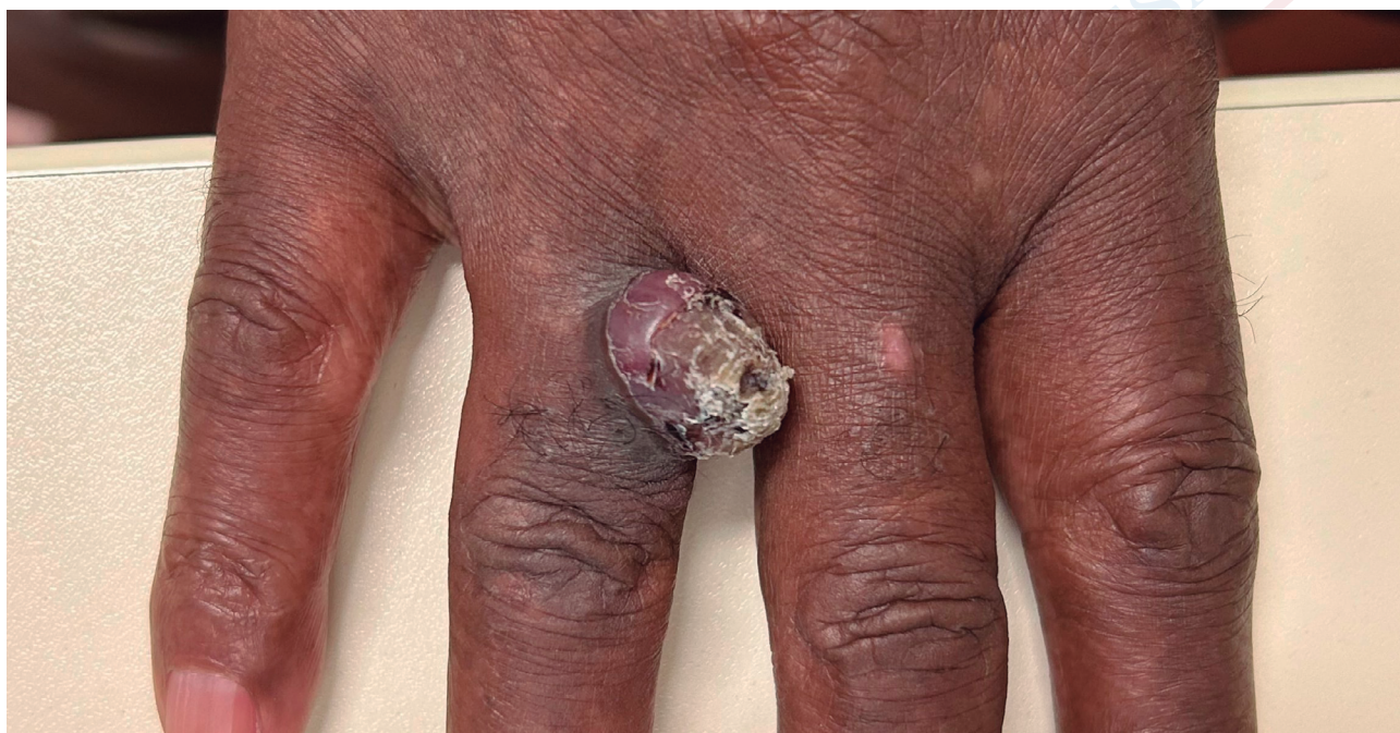
Figure 1 – Violaceous, hyperkeratotic nodule on the fourth digit of the right hand

Palavras-chave: Granuloma Piogénico; Sarcoma de Kaposi