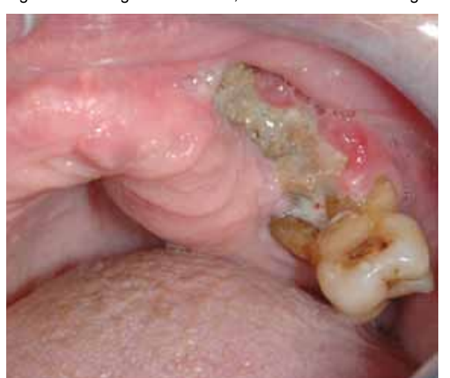
Fig. 2 - Macroscopic aspect of the classic lesion of BRONJ

The authors considered as a working hypotheses that there are also anatomical and systemic<sup>7</sup> conditioning factors for BRONJ: namely, the slow turnover of the basal bone of the jaws, the increased blood supply and more rapid bone remodeling related to periodontal vasculature that causes a higher local drug concentration; the thin mucous coating of