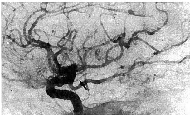
Fig. 2—Left carotid angiogram: segmental stenosis of the anterior choroidal artery.

Cerebrospinal fluid analysis showed a clear sample with a low glucose concentration, and a cell count of 16 mononuclear cells/mm 3 ; bacterial, viral and fungal cultures were all negative. Slow anterior temporo-parietal teta activity was seen on electroencephalogram. Computed tomography of the head disclosed an old left capsular infarct (Figure 1). Cerebral angiography showed arteritis of the anterior left choroidal artery with occlusion (Figure 2). Metronidazole and mebendazole were administered. Patient underwent surgery for removal of the left eye followed by a prosthetic replacement, and was discharged in stable condition.