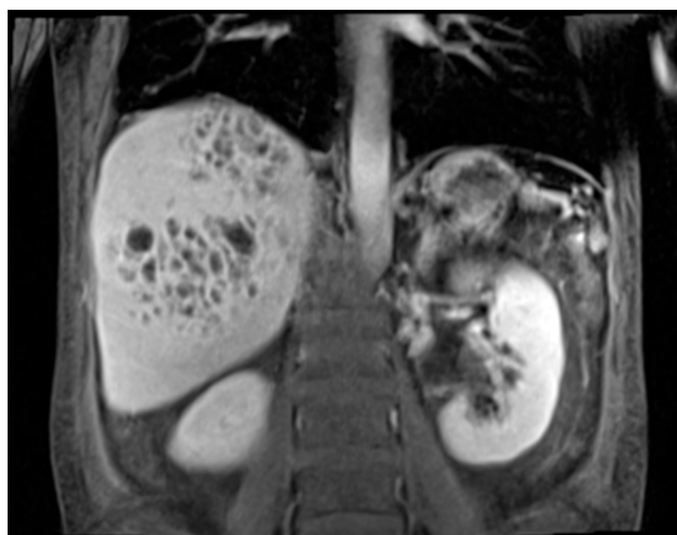
Figure 2 - Coronal section of magnetic resonance imaging

A 45-year-old man with alcoholic liver disease and chronic venous insufficiency presented an insidious history of dorsal pain, anorexia and weight loss. Physical examination revealed fever, jaundice and two skin ulcers in his left leg. Laboratory tests showed leucocytosis of 12 790/mm 3 , C-reactive protein of 24.9 mg/dL, total and direct bilirubins of 1.88 and 1.21 mg/dL, respectively. Abdominal ultrasound showed multiple hypoechoic liver lesions. Magnetic resonance imaging was further performed and revealed several lesions with wall enhancement in IV to