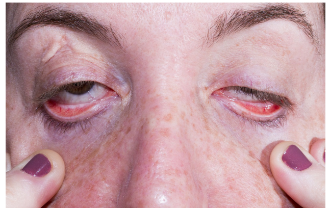
Figure 3 - ZIKV infection-related conjunctival congestion in a 39-year-old woman living in Rio de Janeiro, Brazil. Diagnosis was confirmed by clinical and epidemiological criteria and dengue serology was negative.

Due to the fact that currently no commercial tests allowing for the serological diagnosis of ZIKV infection are available, ZIKV acute infection may be diagnosed by RT-PCR (reverse transcription polymerase chain reaction)