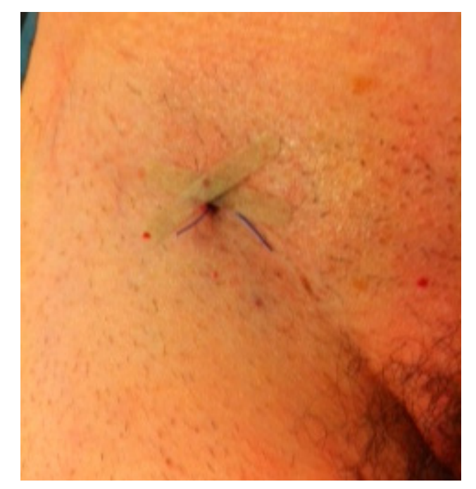
Figure 3 - Dressing in access site, post-EVAR

Finally, closure complication rate in our group of patients (2.5% - one complication) is in line with what has been found in some of the largest systematic revisions, with rates