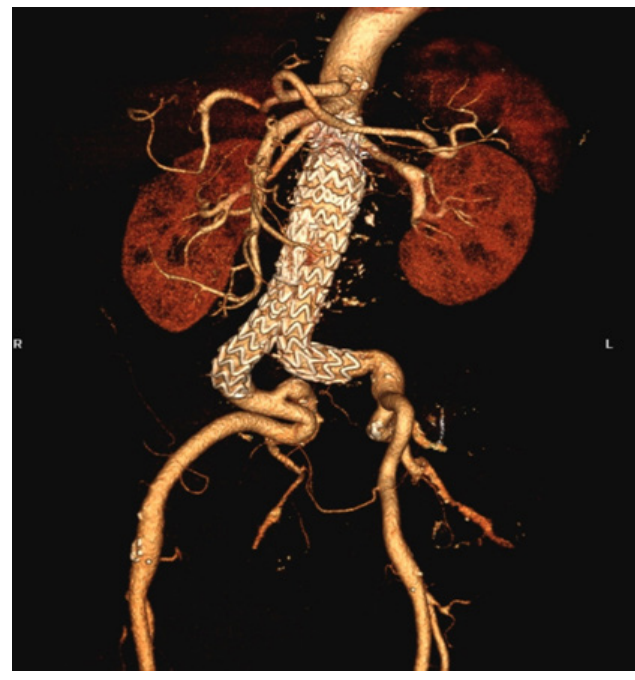
Figure 2 - Three dimensional computed tomographic angiography (3D-CTA) reconstruction post-EVAR

mostly occur within the first hours upon the procedure,<sup>4</sup> local late complications are rare yet possible and usually lead to major complications when not promptly identified, apart from being a reason for re-admission, with all subsequent morbidity. Furthermore, even though any of the patients in our group presented with pre-operatively diagnosed chronic kidney failure, contrast-induced acute kidney injury usually shows at 24-72 hours and therefore may go unnoticed when the patient is immediately discharged home.<sup>19</sup>