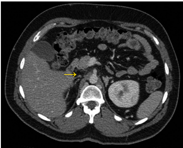
Figure 2 – Axial abdominal computed tomography shows absence of the suprarenal segment of inferior vena cava (arrow)

pelvis was then performed and disclosed absence of the suprarenal portion of the IVC (Fig. 2), with extensive venous collateralization through the azygous and lumbar veins (Fig. 3). The patient was treated in a conservative fashion with