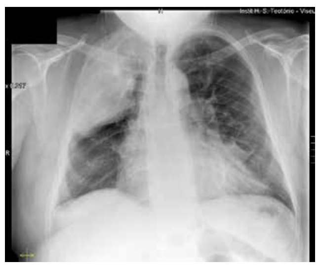
Figure 1 - Radio-opaq image in the right upper lobe.

Keywords: Tuberculosis, Pulmonary; Collapse Therapy. Palavras-chave: Tuberculose Pulmonar; Colapsoterapia.