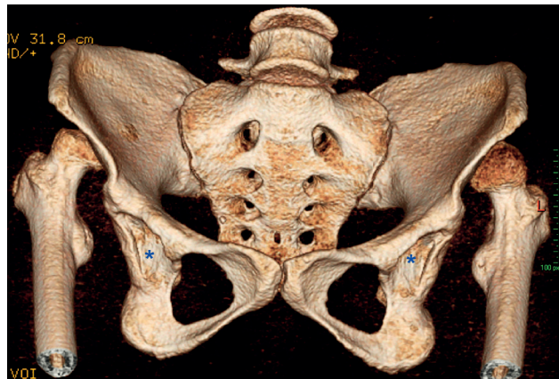
Figure 2 – 3D-CT scan show hypoplastic acetabuli (asterisk) and the femoral heads free-floating within the gluteal muscles.

Three different congenital hip disease types have been described in adults: dysplasia, low dislocation, and high dislocation. 1 In high dislocation, the femoral head migrates superiorly and posteriorly in relation to the hypoplastic true acetabulum. 1