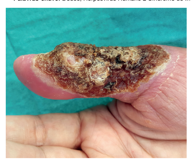
Figure 1 – Large and painful ulceration of the right first finger, evolving for more than one month

Keywords: Acquired Immunodeficiency Syndrome; Fingers; Herpesvirus 2, Human; HIV; Ulcer Palavras-chave: Dedos; Herpesvirus Humano 2 Síndrome de Imunodeficiência Adquirida; Úlcera; VIH